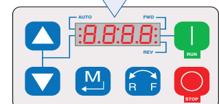
NEMA1 (Up to 10HP) Keypad